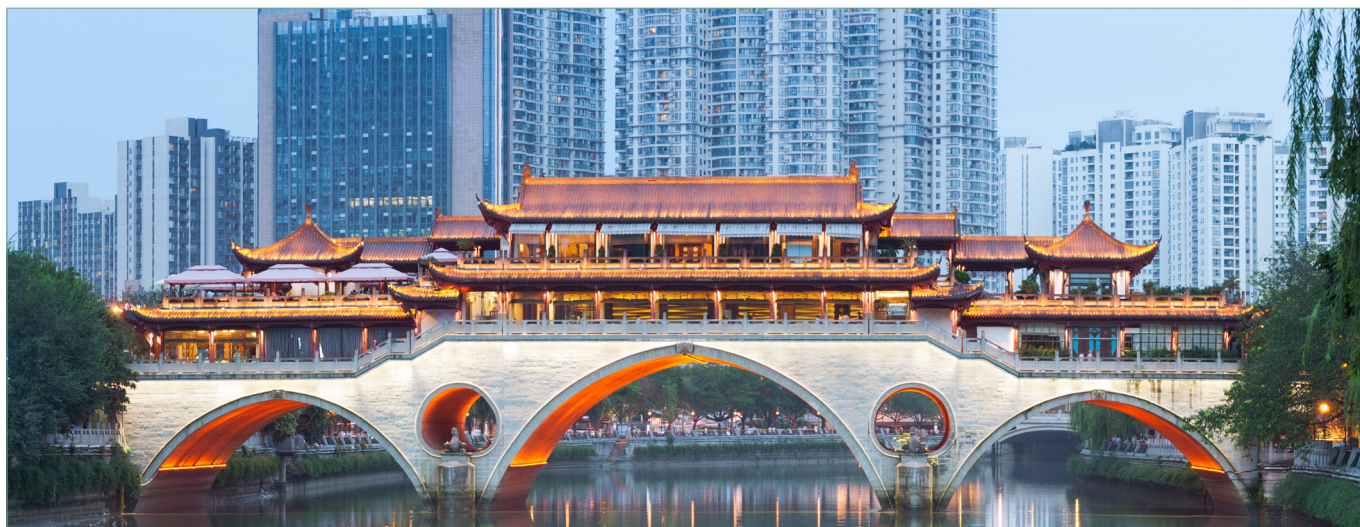
Chengdu has a rich heritage and a moderate continental climate.

The school is situated about an hour's drive from the centre of Chengdu. Chengdu is home to many multinational companies and a large tourist industry, and is a lively city with a friendly and vibrant local and expat community. There is a fast, clean metro system running across the city. For travelling to and from China the airport is a 40 minute drive from the school.